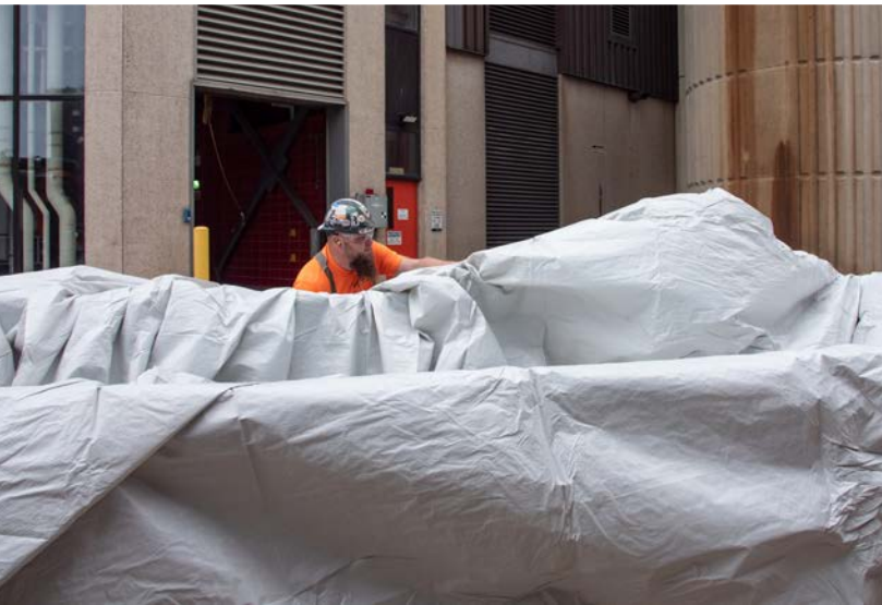
Dry spoils bin is lined due to the fine consistency of excavated materials.