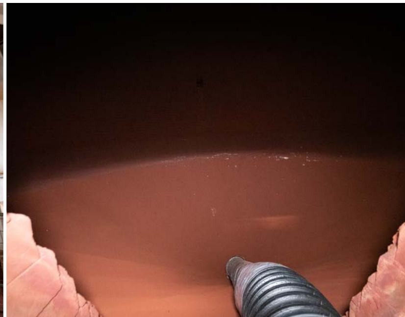
Hose reaches all parts of the incinerator interior for a thorough cleaning.