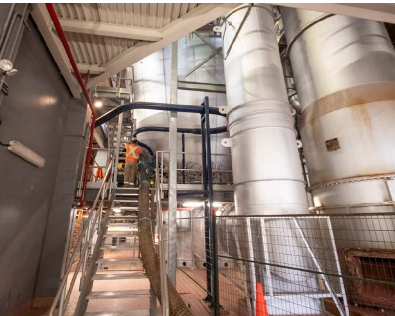
Truck positioned near closest access to building interior containing incinerator